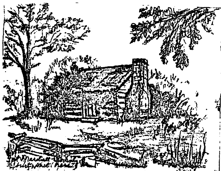
First Marshall County Court met here.