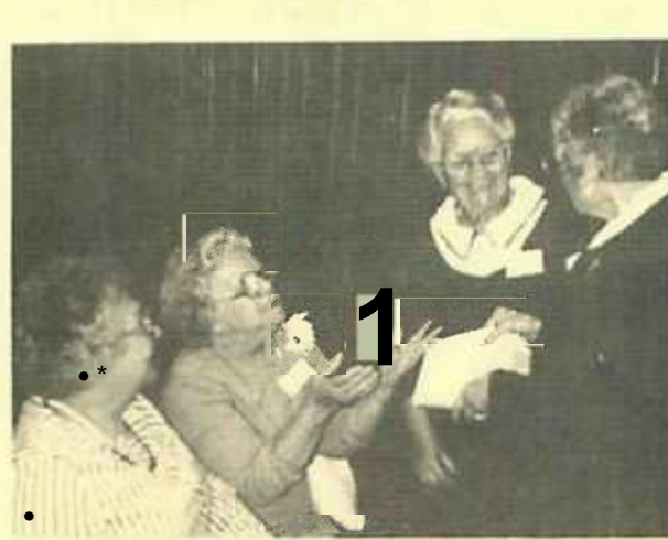
(--30,29 28,33 60,18-->