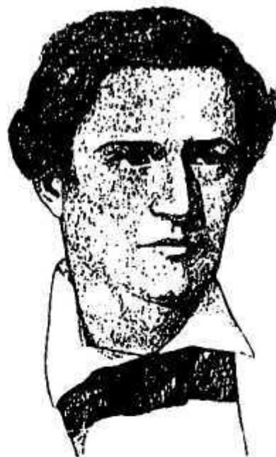
COLONEL JOHN COFFEY HAYS