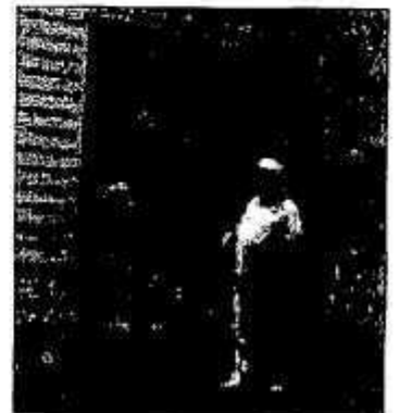
Now what do you think Bill was telling the tour guide???