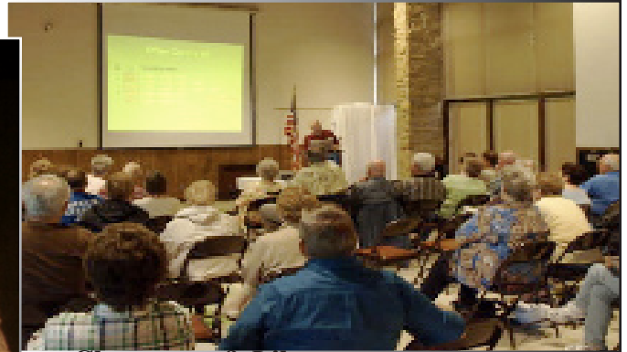
Class room & Library