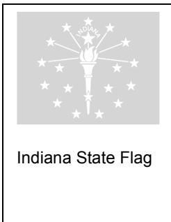
Indiana State Flag

Let's make this a big one! Please notify all of your Indiana Coffey Cousins.