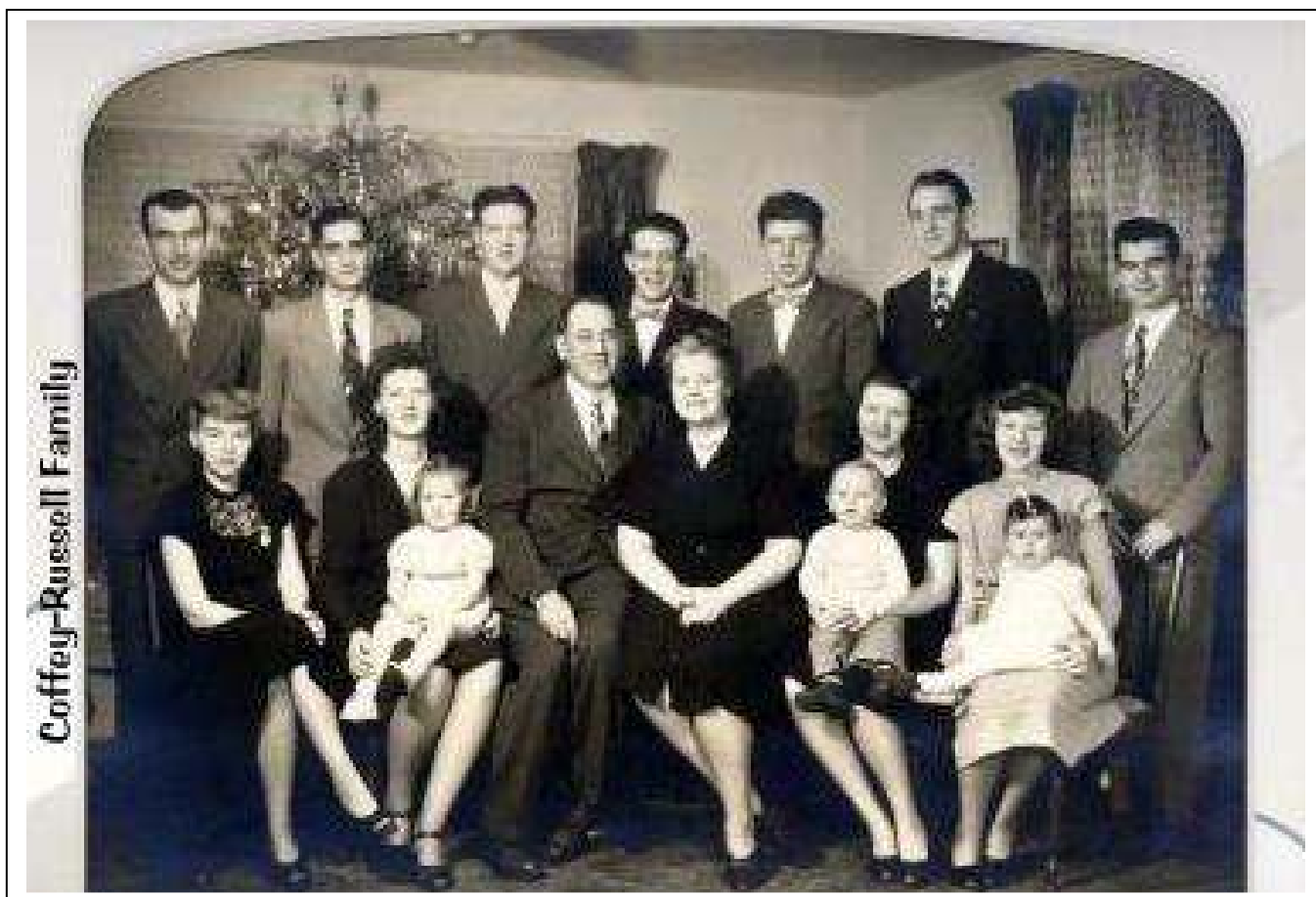
The Coffey-Russell Family